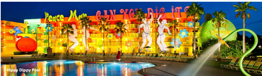
Hippy Dippy Pool