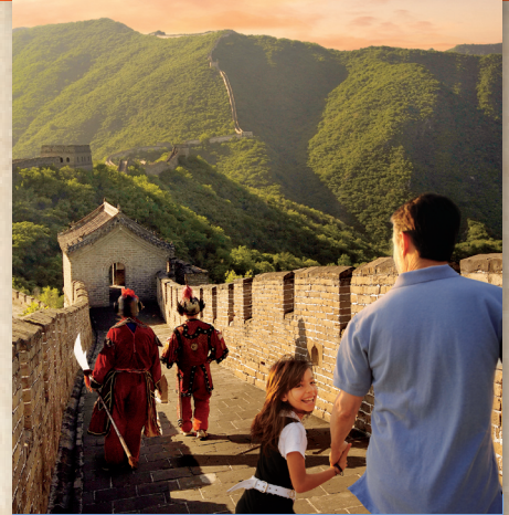
MEET ANCIENT WARRIORS IN CHINA