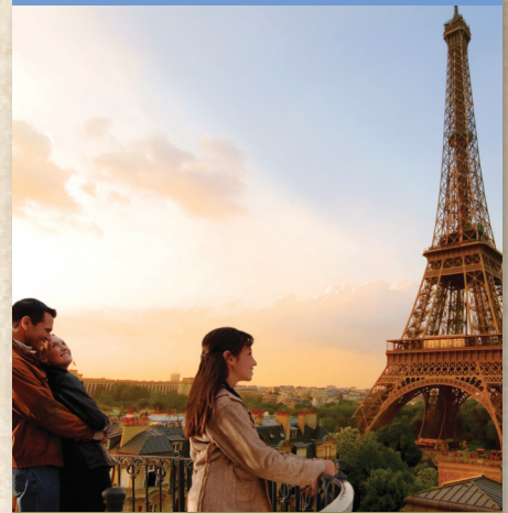
DINE IN THE EIFFEL TOWER